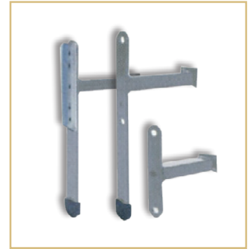
Armrest brackets with or without sliders