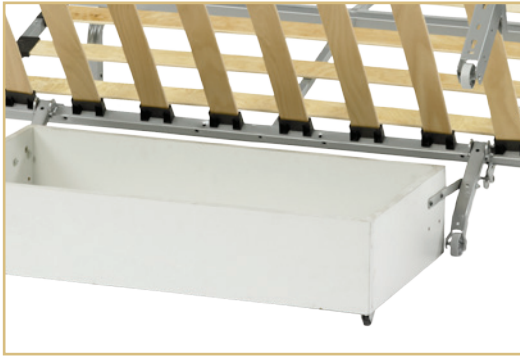
Pair of fixations for storage case