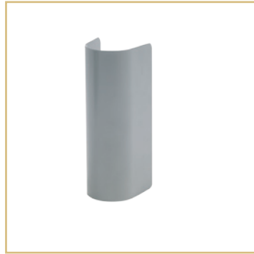
Optional leg cover