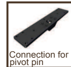
Connection for pivot pin