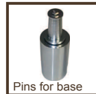
Pins for base